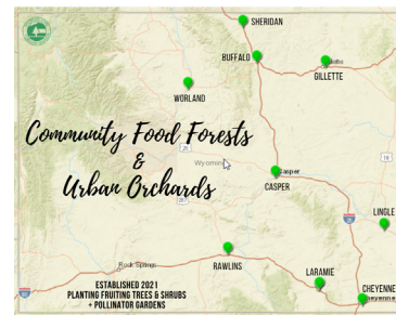
Community Food Forests and Urban Orchards located in communities across Wyoming.

WSFD partnered with the University of Wyoming Extension to work with the Master Gardener (MG) programs across the state. By working with MG volunteers, these projects have and will gain exposure to a like-minded community network of volunteers, provide public beautification, and offer numerous training demonstrations for the public, local interest groups, and MGs. These trainings could include class topics such as proper planting, identification, pruning, harvesting, clean up, and propagation. Harvested produce will be made available to those in need - by being donated to those who come to harvest on their own or by donations made to local food banks.