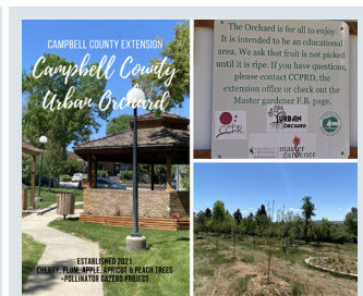
The Campbell County Master Gardener program improved their gazebo area and planted many new fruiting trees near Complex Park in Gillette, WY.