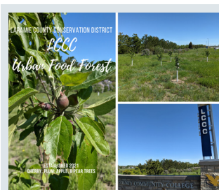
Laramie County Master Gardeners along with Laramie County Conservation District planted an urban orchard at the Laramie County Community College in Cheyenne, WY on May 22, 2021.