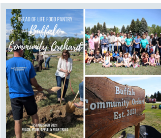
Buffalo, WY community orchard planting project was installed with the help of the Boys and Girls Club of Buffalo, the First Lady and Governor of Wyoming, and community volunteers on June 1, 2021.